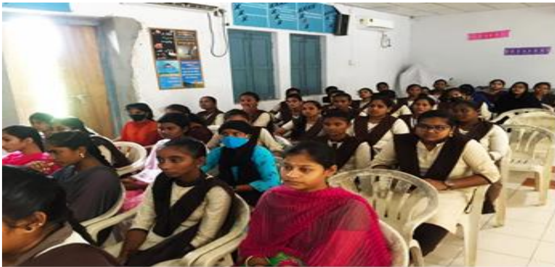
Distributed Voters application