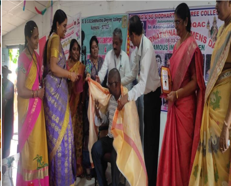
women's Day Celebrations